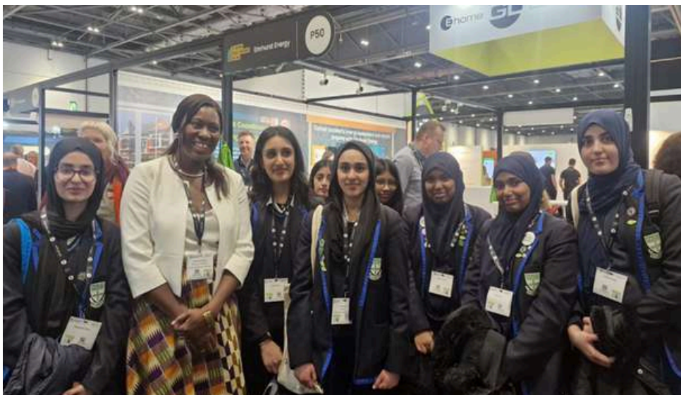
Some our students with the Right Hon. Miatta Fahnbulleh, the Energy Consumers Minister