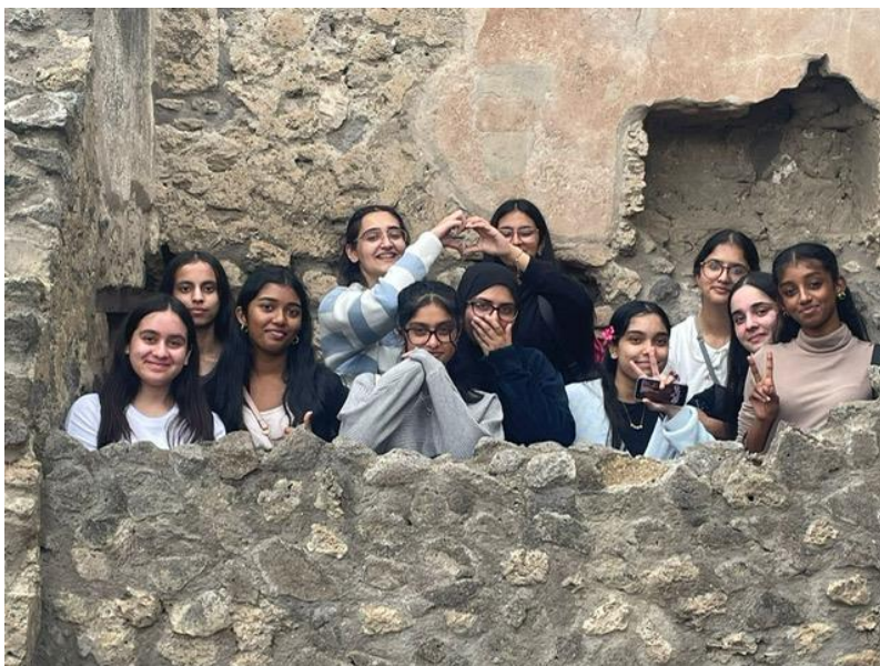
Students at the Summit of Mt Vesuvius