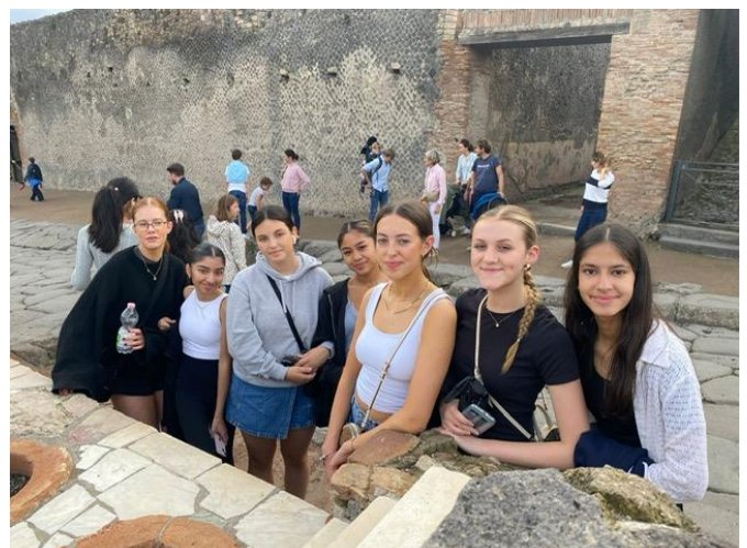
Y11 students in Pompeii