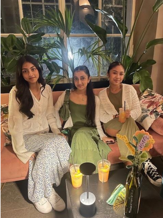
Y11 Students enjoying the party on the last night.