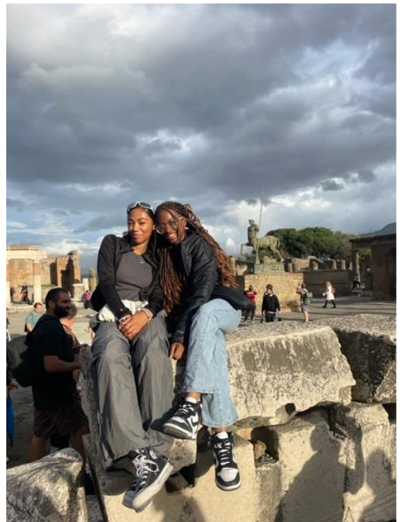
Y12 students in Pompeii