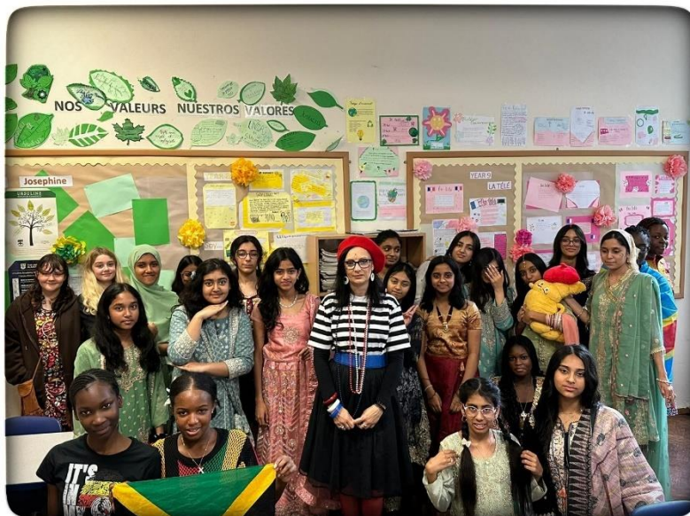
8J for Cultural Day