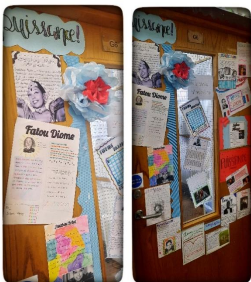
Year 7 display for BHM