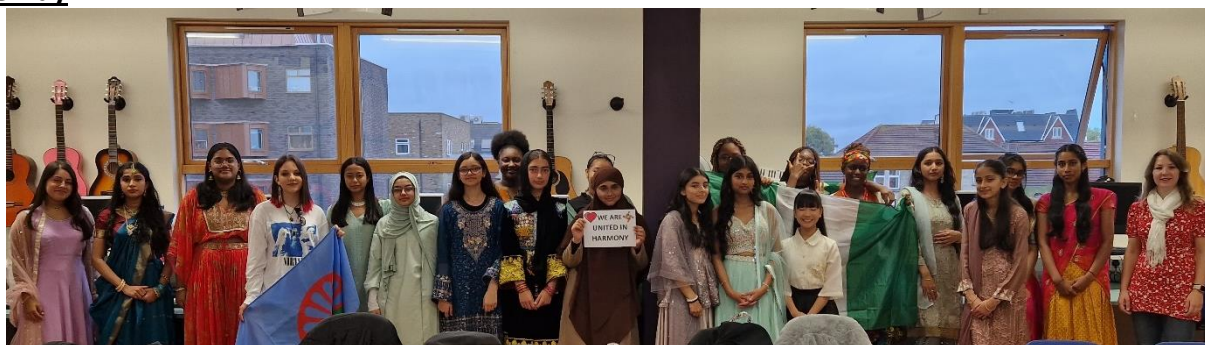
10 Ursula – 'United in Harmony' – celebrating our different cultures on Culture Day